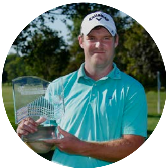
Grayson Murray 2016