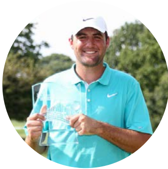
Scottie Scheffler 2019