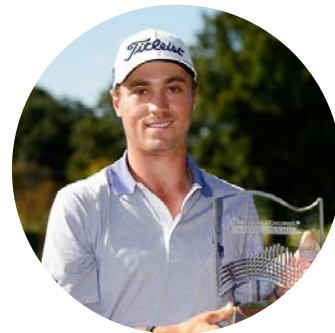
Justin Thomas 2014