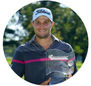
Peter Uihlein 2017